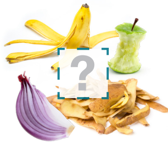
Fruit & vegetable scraps