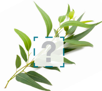
Leaves & prunings