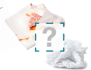
Tissues & paper towel