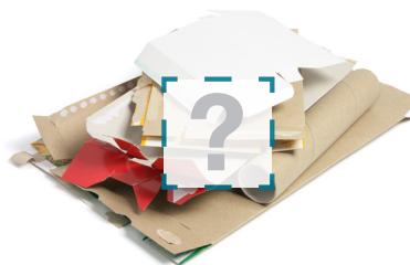
Paper & cardboard