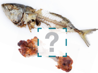
Meat, bones & seafood