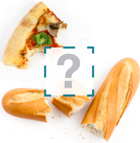
Raw or cooked leftover food