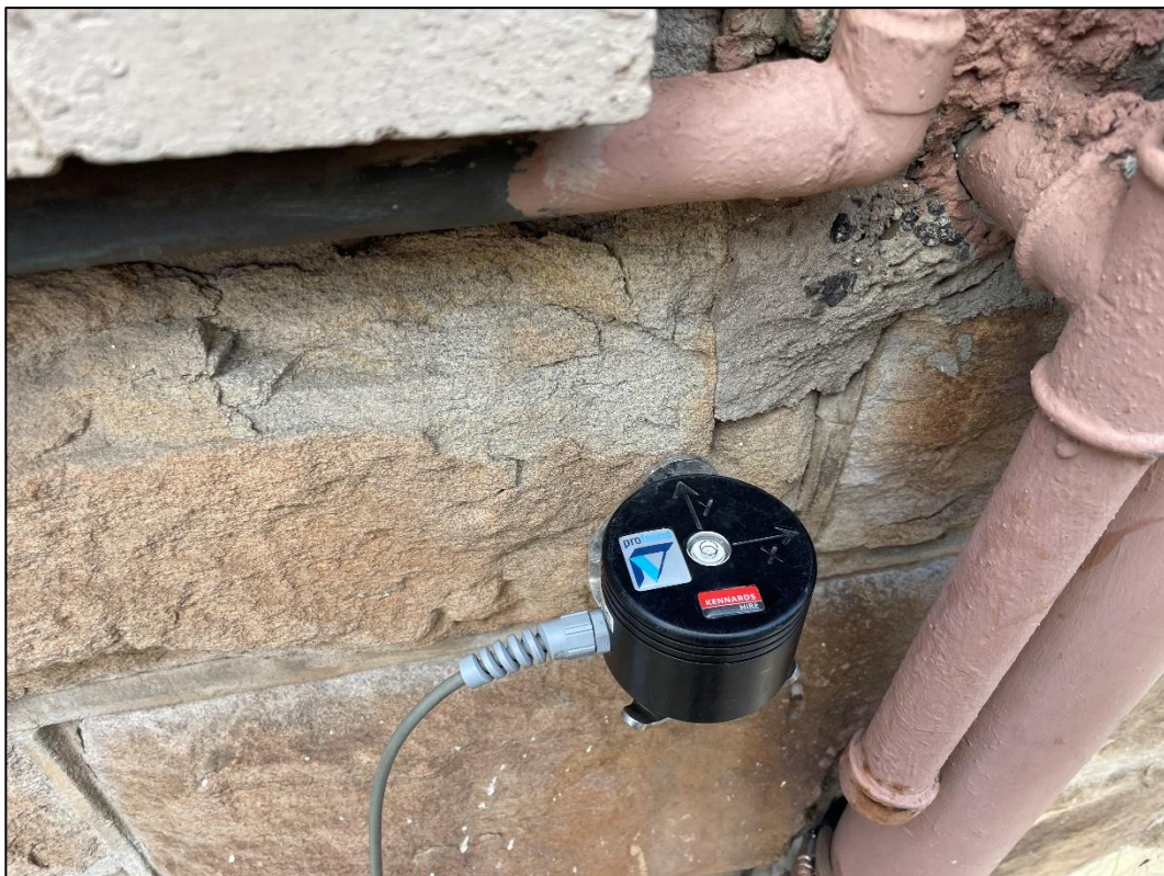
Photograph 2 Location of 'Monitor 2', affixed to the sandstone façade on the western side of the building, approximately 5 m from the closest edge of works. Note that the monitor has been affixed through an existing drilled hole in the sandstone which will be re-affixed at the completion of monitoring.