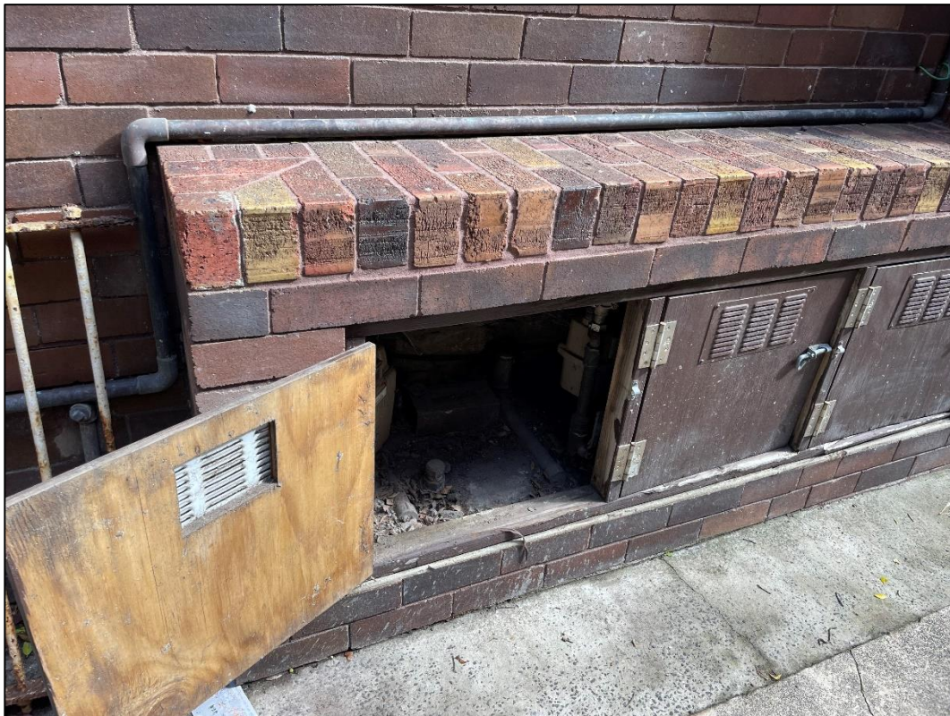
Photograph 1 Location of 'Monitor 1', affixed to the brick façade (within the gas meter enclosure) on the northern side of the building, approximately 15 m from the closest edge of works.